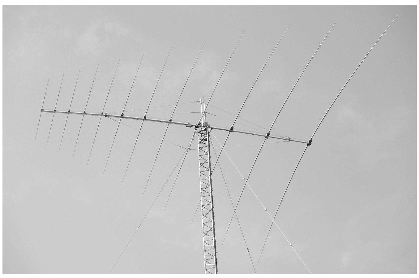
Model CLP720, Illustration

★ Light Weight, Easy and Rapid Installation